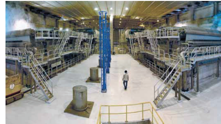
▲ ANDRITZ delivered the two-machine pulp drying plant with automated baling lines.

"We almost forget about the white liquor plant – which is a compliment," Araujo says