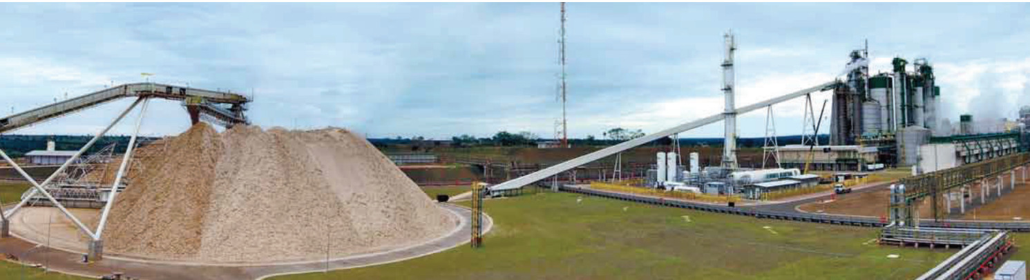
▲ View of the massive Eldorado mill from the woodyard. The new 360-degree Stack-Reclaimer is in the foreground.