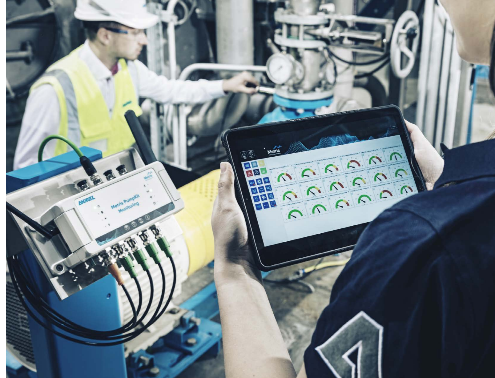
The PumpKit automatically analyzes large volumes of data and provides clear evaluations and recommendations for action.

The Metris PumpKit can be retrofitted at any time regardless of the other systems or existing infrastructure. As a matter of fact, many existing pumps and other mechanical devices are still running "blind", as the way